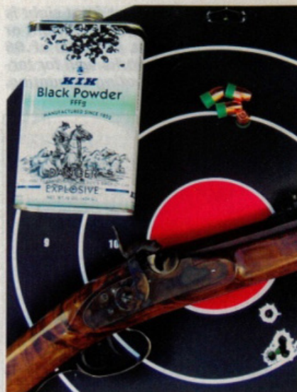
The Pedersoli's 1-in-24-inch twist lets it shoot modern sabots well.

I tried several other bullets from various manufacturers to include the new, 250-grain, CVA SlickLoad Sabot bullets with loads of between 80 and 95 grains of Kik powder. With every bullet tested, I had no problem shooting five-shot